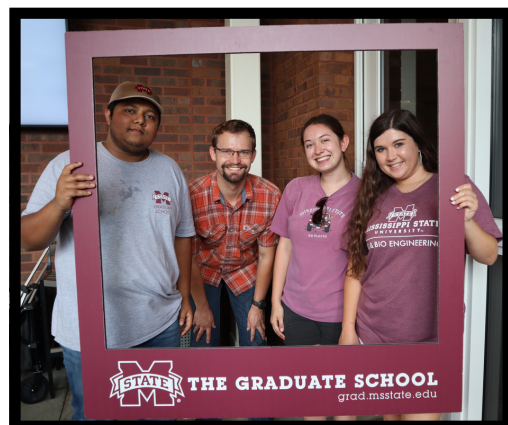
Graduate Students @ the Ice Cream Social Event