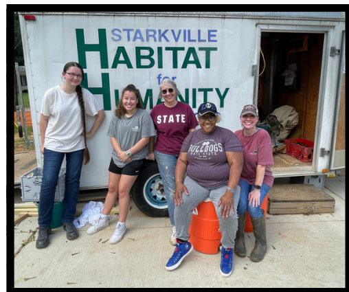
GSA Members and TGS Staff

If you and/or your department/team would like to volunteer with Habitat for Humanity, visit their website here .