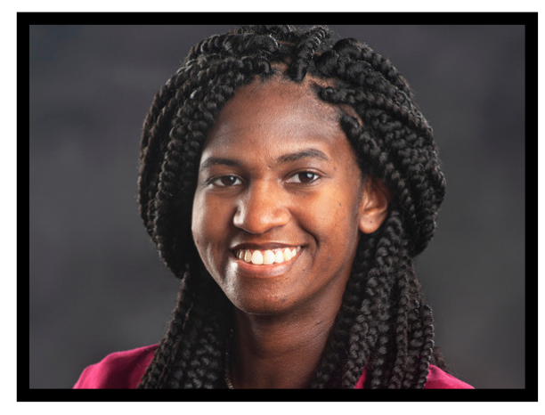
Scholars, M. N. About. https://mcnairscholars.com/about/.

Please help us recognize all of these outstanding students!